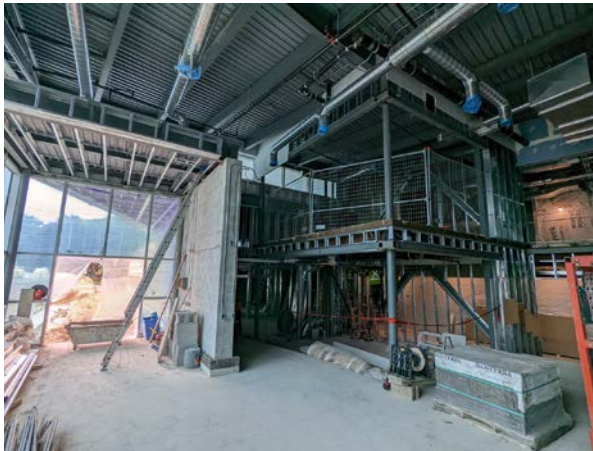
Interior: View towards the west (main entry and lobby area)