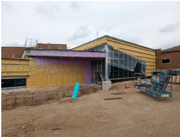
Exterior: View towards the north (South Entry from Hardy Ave.)

Interior steel stud framing, drywall installation, HVAC, plumbing, electrical, and sprinkler work is continuing to push forward. Concrete block erection is continuing within the existing renovated areas and brick work has now commenced within the vestibule/lobby areas. The new lobby stair is also set in place.