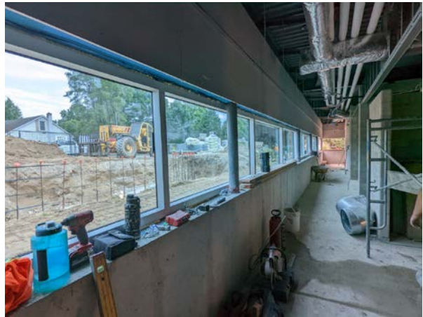
Interior: View towards the west (accessible change room)