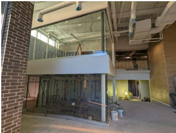
Interior: View within the Main Lobby