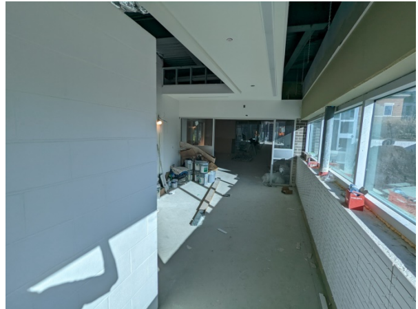
Interior: View within the Accessible/Family Change Room