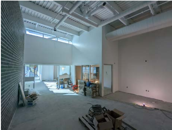
Interior: View within the Lower Lobby at the Accessible/Family Change Room entry