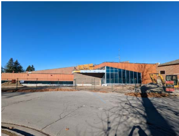
Exterior: View north (south entrance from Hardy Ave.)