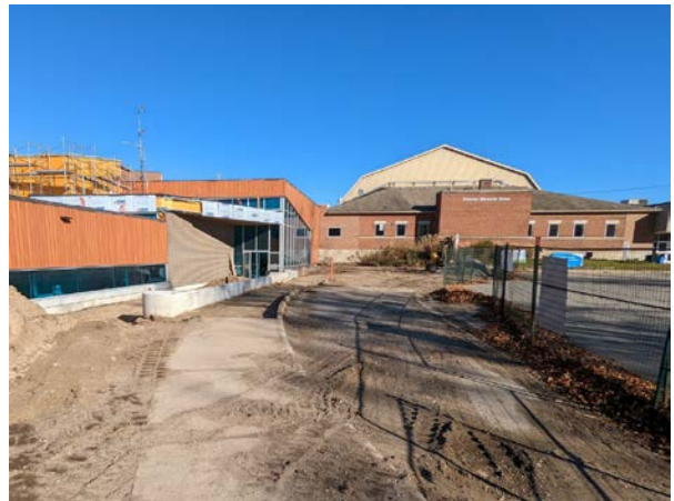
Exterior: View east (south entrance from Hardy Ave.)