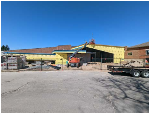
Exterior: View towards the north (South Entry from Hardy Ave.)

Construction of the low, mid and high parapets is complete, installation of the low roof assembly has begun, and exterior wall assembly construction is continuing.