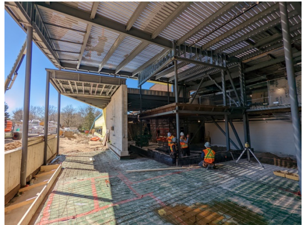
Interior: View of the main entry and lobby area