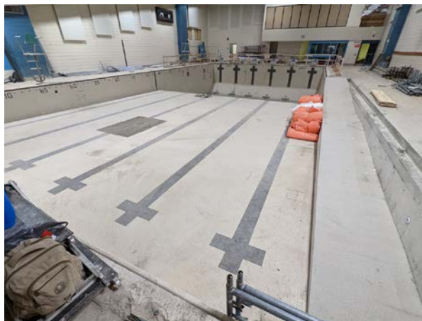
Interior: View of the new accessible ramp within Kinsmen Pool