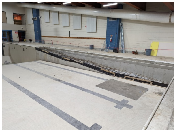
Interior: View of the new accessible pool ramp