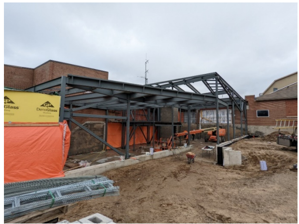
Exterior: View towards the future main entry (ground floor level)