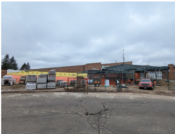
Exterior: View towards the north (South Entry from Hardy Ave.)

As construction continues, we will see the building envelope and accessible change room interiors further develop in February.